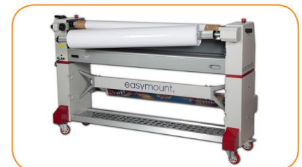
Rear mandrel swings-out for easier loading of laminate