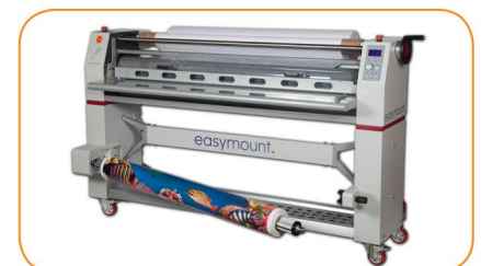
Front mandrel swings-out for easier loading of vinyl