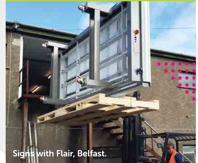
Signs with Flair, Belfast.